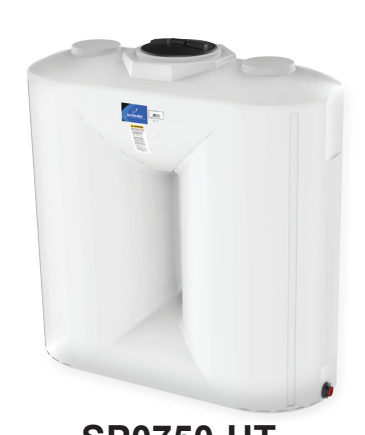
SP0750-UT Dimensions: 35" x 82" x 86" Shipping Weight: 318 lbs.