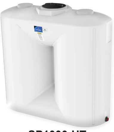
SP1000-UT Dimensions: 40" x 92" x 89" Shipping Weight: 407 lbs.