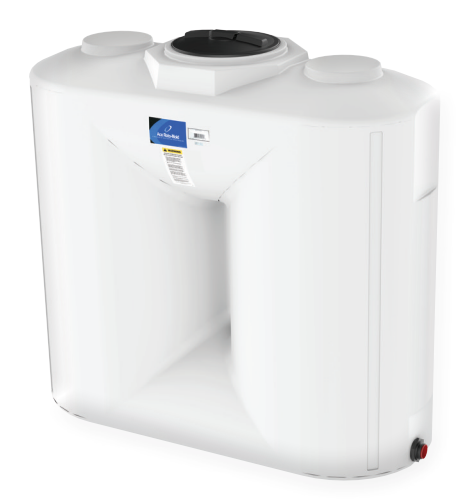
500 Gallon SP0500-UT

Den Hartog Industries, manufacturer of the ACE Roto-Mold Tanks announcing the addition of three new capacities of Slim-Line Utility Tanks to our product offering. The new models, 500 gallon, 750 gallon, and the 1,000 gallon have been added to the current offerings of 250 gallon, 300 gallon and 400 gallon. Designed for commercial or residential installations requiring a narrow footprint.