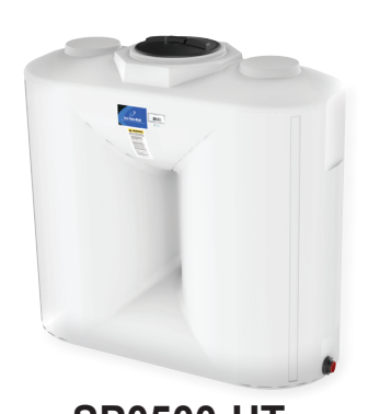
SP0500-UT Dimensions: 31" x 74" x 70" Shipping Weight: 223 lbs.